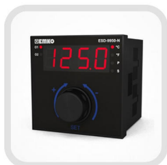
Analogue Temperature Controller