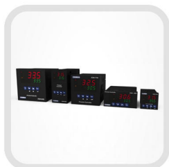
Process Control Devices