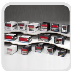
Digital Preset Counter