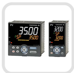
Digital Indicator Controller UT35A & UT32A