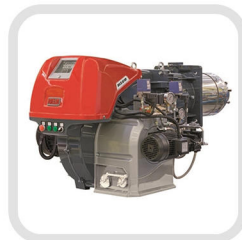
Dual Fuel Burners RIELLO Burners