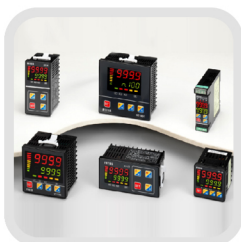
Digital Temperature Controller