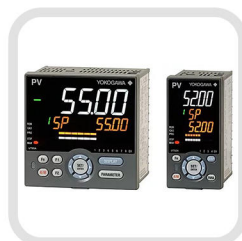
Digital Indicator Controller UT55A & UT52A