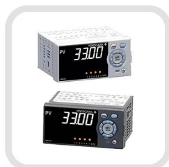
Digital Indicator Controller - UM33A