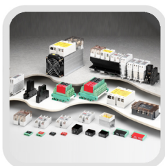
Solid State Relay Module