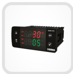
Digital Temperature + Humidity Controller