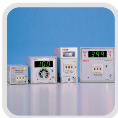
Analog Temperature Controller