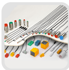
Proximity Switch Sensor