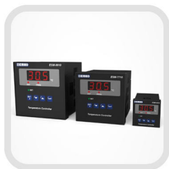
Digital On/Off Temperature Controllers