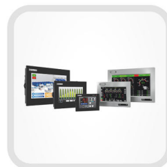
Professional Operator Panels