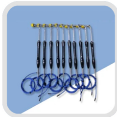
Thermocouple Surface Probe