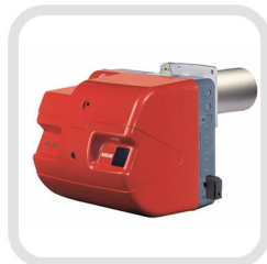
Oil Burners RIELLO Burners