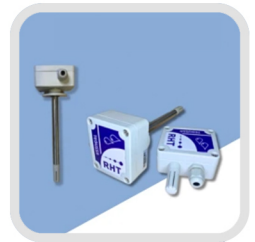
RHT Humidity Sensor