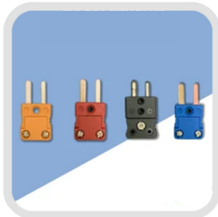
Socket & Plug Thermocouple