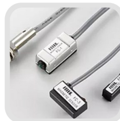
Magnetic Switch Sensor