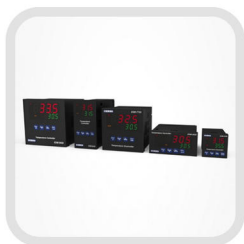
PID Temperature Controller