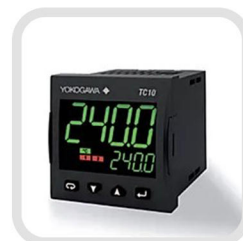
Temperature Controller - TC10