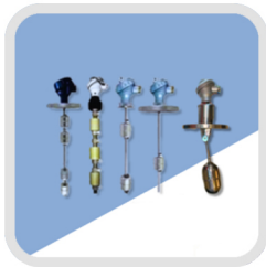
Float Ball Level Switch