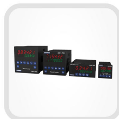
Timers & Counters