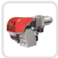
Gas Burners RIELLO Burners